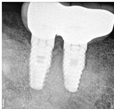
Figure 5. Periapical radiograph taken 8-year following prosthesis delivery.