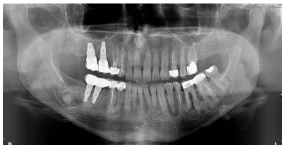
Figure 4. Orthopantomogram taken 8-year following prosthesis delivery.

In terms of oral rehabilitation with implants in FCOD, the avascular nature of these lesions might complicate the osseointegration of the implants and if secondary infection occurs, it will be aggressive and difficult to treat. The main expected complications have been reported as poor healing, risk of infection and fracture of the jaw. 12,18,19