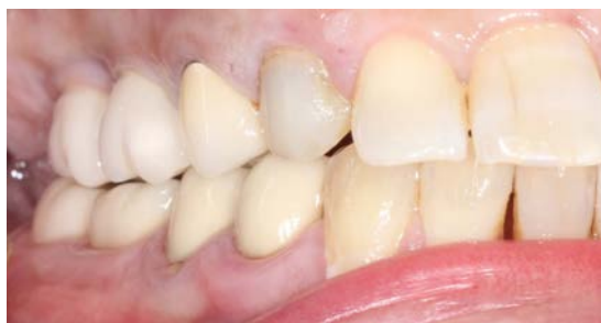
Figure 6. Clinical photograph of the implant prosthesis and adjacent teeth (frontal view at centric occlusion).