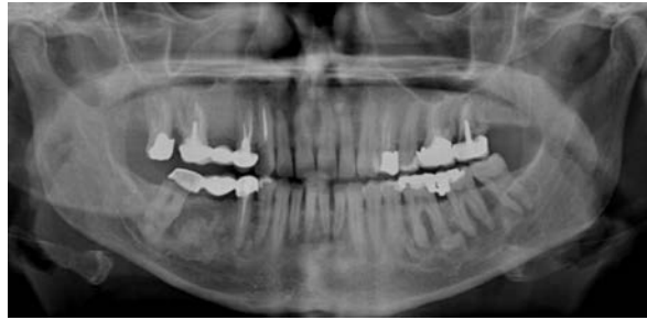
Figure 1. Orthopantomogram pre-extraction of mandibular right second molar.

A more mature FCOD lesion is transformed to dense, acellular, avascular and sclerotic, calcified tissue. 3 The regeneration, osseointegration and healing capacity of the affected alveolar bone is reduced. 9 It has been reported that dental implant placement in the affected region may produce osteomyelitis. 13 During the preparation of osteotomy site, the bony tissue surrounding dental implant might get necrosed due to overheating. The damage to the bone can be increased if drilling is performed without sufficient cooling. 14 Necrosis often leads to osteomyelitis if the adjacent inflammatory process is spread into the sclerotic bone. 15 Bony sequestrum formation 16 and infection are the primarily associated radiological features with chronic osteomyelitis. Infection requires debridement and enucle-