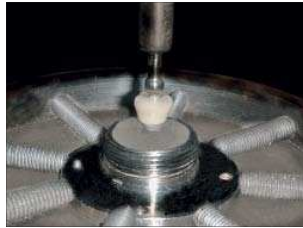
Fig 2 Frontal view of the loading apparatus.