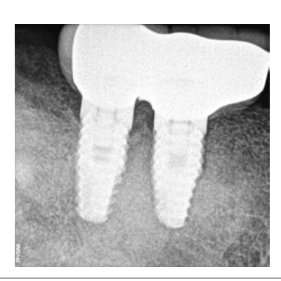
Figure 5. Periapical radiograph taken 8-year following prosthesis delivery.