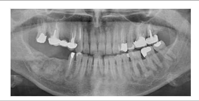
Figure 2. Orthopantomogram before the surgery.