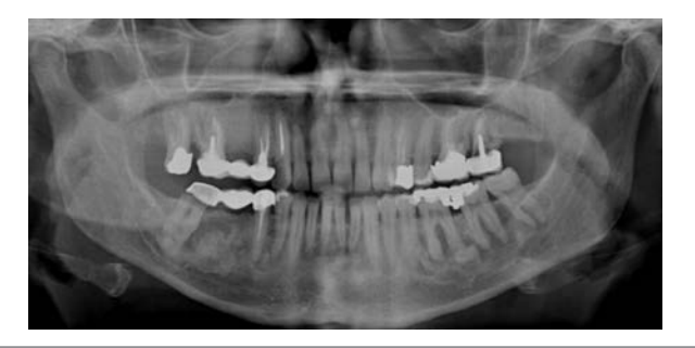
Figure 1. Orthopantomogram pre-extraction of mandibular right second molar.

A more mature FCOD lesion is transformed to dense, acellular, avascular and sclerotic, calcified tissue.3 The regeneration, osseointegration and healing capacity of the affected alveolar bone is reduced.9 It has been reported that dental implant placement in the affected region may produce osteomyelitis.13 During the preparation of osteotomy site, the bony tissue surrounding dental implant might get necrosed due to overheating. The damage to the bone can be increased if drilling is performed without sufficient cooling.14 Necrosis often leads to osteomyelitis if the adjacent inflammatory process is spread into the sclerotic bone.15 Bony sequestrum formation<sup>16</sup> and infection are the primarily associated radiological features with chronic osteomyelitis. Infection requires debridement and enucle-