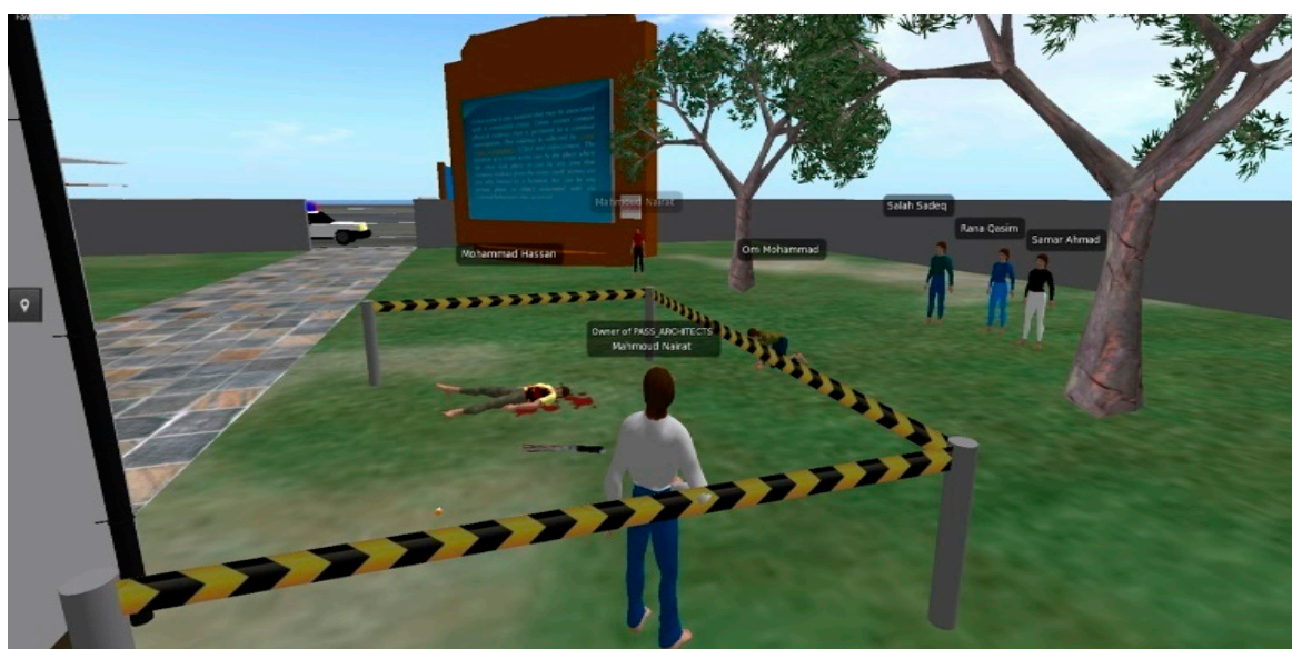
Figure 1. Crime scene area in the virtual immersive environment.

The developed 3D virtual learning environment (3DVLE) consists of two areas: (1) a crime scene area and (2) a molecular biology lab area. The crime scene area has a courtyard with yellow striped tape around the scene from three sides as depicted in Figure 1. Also, the crime scene area has 3D components including a dead body, a police officer maintaining the crime scene and witnesses as non-player characters (NPCs). It contains also biological forensic evidence containing DNA molecules, such as bloodstains, cigarette butts, hair, and a bloody knife.