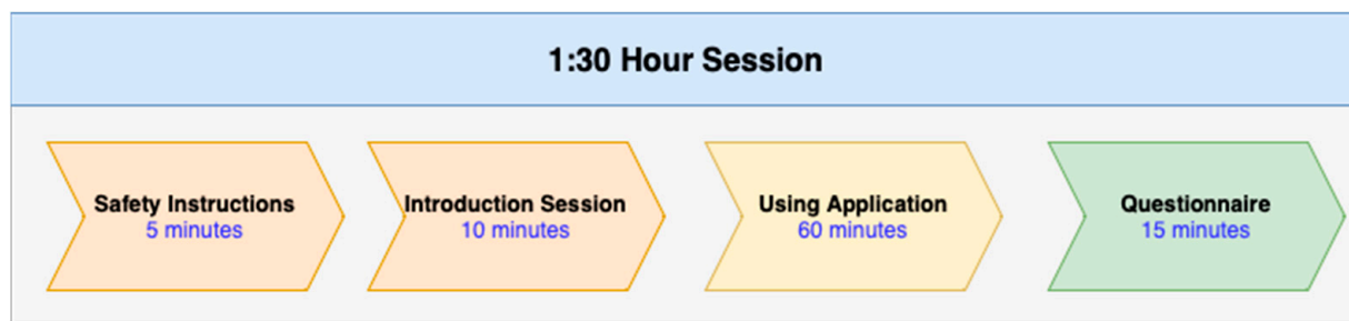
Figure 3. Evaluation sequence and procedure.

The evaluation was conducted inside both universities' labs, equipped with computers and internet connection. The experiment took place during the laboratory session (1 h and 30 min) and included different steps as depicted in Figure 3. Participants in these the two groups (face-to-face and online) were selected and distributed randomly.