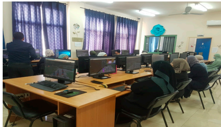
Figure 4. VR module evaluation process at AAUP during a face-to-face session.