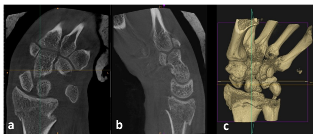
Figure 1. Dental CBCT images of an adult patient with a splint: a. coronal view, b. sagittal view, and c. 3D imaging scanned with high radiation dose protocol.