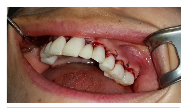
Figure 15. Temporary bridge in place after crown lengthening and before adjustment.