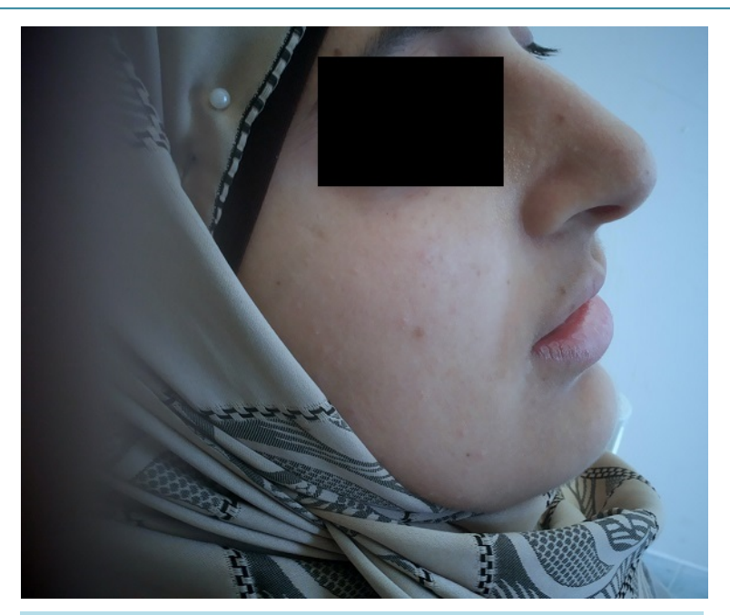
Figure 12. Lateral view for patient with cemented temporary bridges, the lower facial height was increased and naso-labial angle was reduced.

Frenectomy for upper labial frenum and crown lengthening for maxillary teeth were performed using surgical stent depending on the diagnostic wax up to realine the gingiva, the temporary bridge was readjusted and cemented using temporary cement, a periodontal back was adjusted on gingival tissue ( Figures 13-16 ).