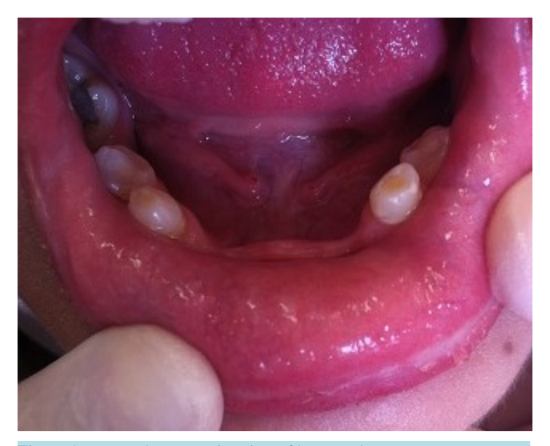
Figure 1. Intra oral preoperative view of lower arch.

During intraoral examination the absence of 18 permanent teeth was noticed, including maxillary lateral incisors and canines, maxillary right and left second premolars, maxillary right first molar and second molar, mandibular central and lateral incisors and canines, second premolars and second molars. Maxillary and mandibular primary canines were present. Regarding soft tissue the maxillary labial frenum was enlarged, oral hygiene was considered satisfactory and no previous dental treatment was performed. The patient presented upper excessive spaces between teeth, and deep overbite with increased freeway space. The patient reported severe esthetic dissatisfaction which resulted in several social problems (Figure 1 and Figure 2).