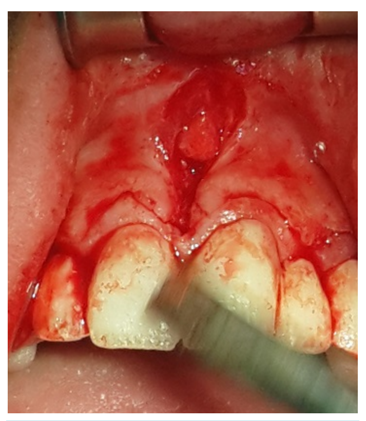
Figure 13. Frenectomy.

Frenectomy for upper labial frenum and crown lengthening for maxillary teeth were performed using surgical stent depending on the diagnostic wax up to realine the gingiva, the temporary bridge was readjusted and cemented using temporary cement, a periodontal back was adjusted on gingival tissue ( Figures 13-16 ).