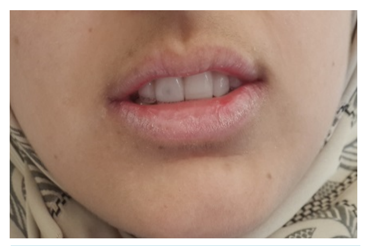
Figure 11. Temporary bridges cemented in patient's mouth.

When the resin was set the index and temporary bridges were removed from casts, the temporary bridges were finished, polished and tried in patient's mouth to verify fit, marginal adaptation, and occlusion was equilibrated to the new vertical dimension of occlusion. Temporary bridges were cemented using zinc oxide eugenol-based temporary cement (TempBond, Kerr Corporation, Orange, CA) (Figure 11 and Figure 12).