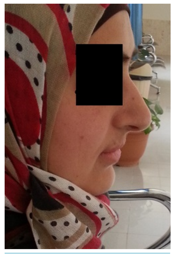
Figure 3. Extra oral preoperative view.

Extraoral clinical examination revealed a mild reduction in lower third of facial height with a marked nasolabial angle (Figure 3).