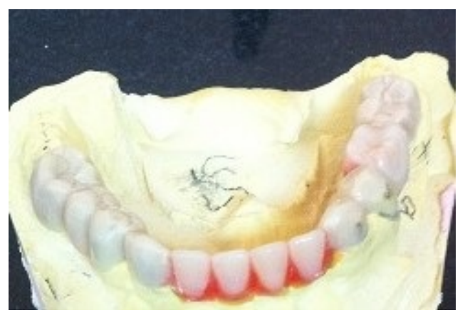
Figure 5. View for the lower arch diagnostic wax up.

The diagnostic wax up of the proposed fixed bridges were duplicated using light viscosity addition silicone impression material (Elite Model). The impressions were then poured in dental stone (Elite Rock), and a silicone indices (Hydrorise Heavy, Zhermack Inc.) were fabricated on this new duplicated casts.