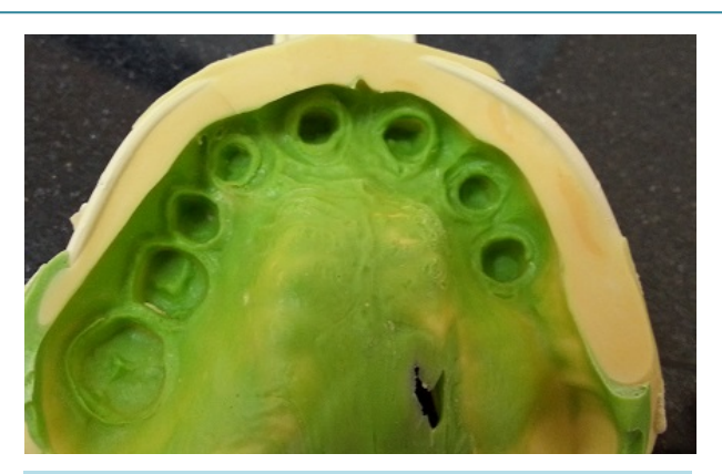
Figure 17. Upper secondary impression.