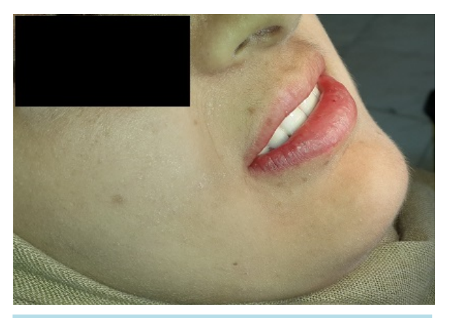
Figure 20. Extroral view after cementation of permanent bridges.