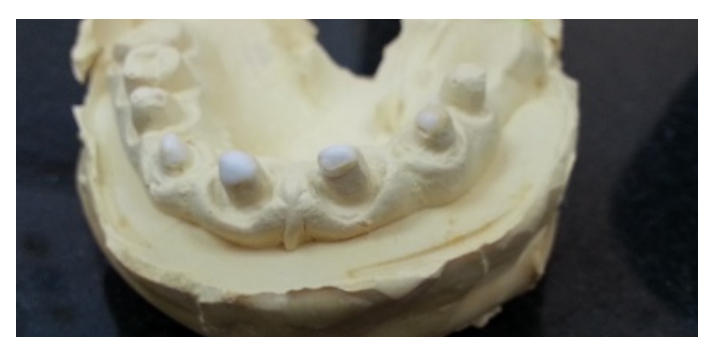
Figure 10. Upper diagnostic cast of prepared teeth for temporary fabrication.

When the resin was set the index and temporary bridges were removed from casts, the temporary bridges were finished, polished and tried in patient's mouth to verify fit, marginal adaptation, and occlusion was equilibrated to the new vertical dimension of occlusion. Temporary bridges were cemented using zinc oxide eugenol-based temporary cement (TempBond, Kerr Corporation, Orange, CA) (Figure 11 and Figure 12).