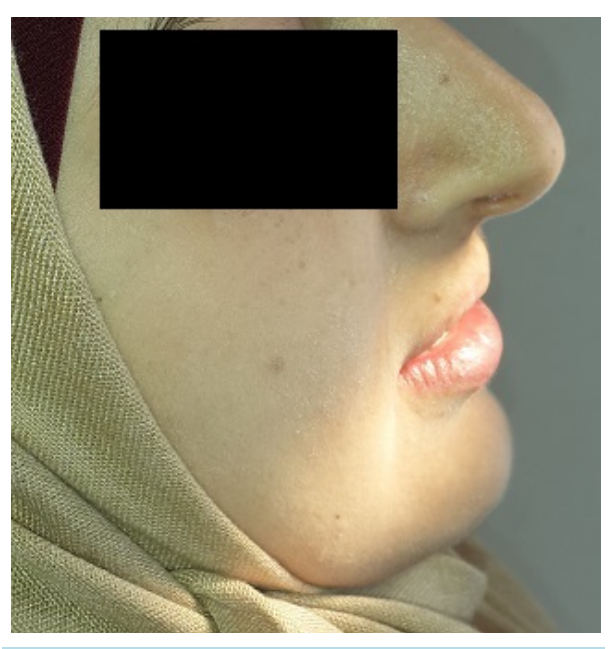
Figure 21. Extraoral lateral view after cementation of permanent bridges.